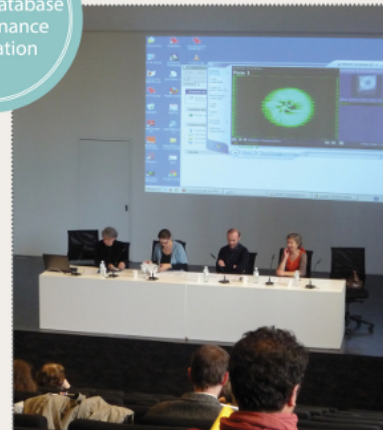
2013 seminar topic: "Personal practices, professional memory: from mastering to transmitting"

The discussion list archives are hosted by the Enssib LIS school. The most popular topics debated are summarized and published on the website as technical help sheets.