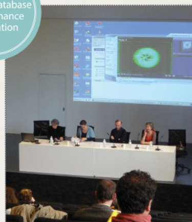
2013 seminar topic: "Personal practices, professional memory: from mastering to transmitting"

The discussion list archives are hosted by the Enssib LIS school. The most popular topics debated are summarized and published on the website as technical help sheets.